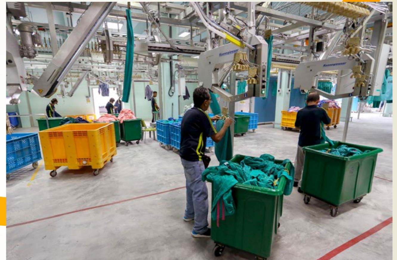
Set up of new external laundry facility

SCORE set up a new external laundry facility to help broaden transitional employment opportunities for ex-offenders.