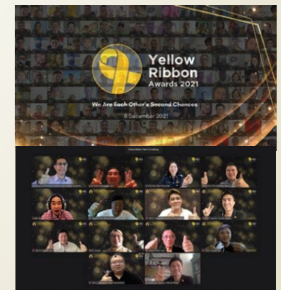
/ The Yellow Ribbon Awards Ceremony themed “We Are Each Other’s Second Chances”

The Yellow Ribbon Awards Ceremony (YRAC), themed “We Are Each Other’s Second Chances”, acknowledged the efforts of employers, community partners, ex-offenders, and volunteers in promoting second chances for inmates and those reintegrating into society. YRAC also saw the consolidation of two previous award ceremonies - the SCORE Appreciation Award Ceremony and the Yellow Ribbon Celebrating Second Chances Award Ceremony.