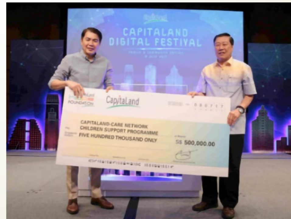
/ Cheque presentation for CapitaLand-Yellow Ribbon Fund Children Support Programme

CapitaLand-Yellow Ribbon Fund Children Support Programme was piloted with the aim of reducing intergenerational offending and to rally agencies to come forward in supporting the well-being of inmates’ and ex-offenders’ children.