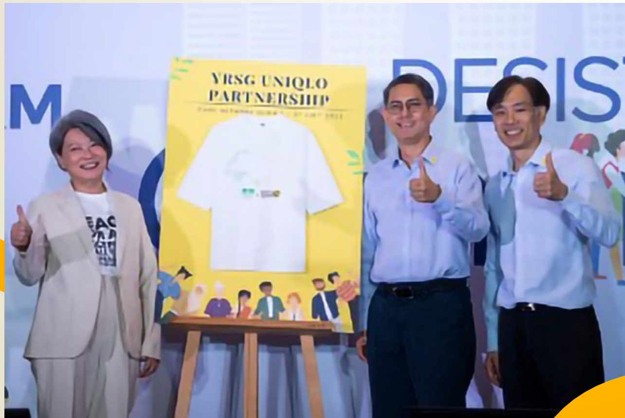
/ Partnership between YRSG and Uniqlo Singapore announced during CARE Network Summit 2023

The 2023 CARE Network Summit focused on the concept of desistance, exploring the nature of the journey towards cessation of certain behaviours. Discussions revolved around what this journey might entail and how communities could provide support to individuals undergoing this process. The summit brought together community leaders, researchers, and partners to share insights and collaborative initiatives. During the summit, a partnership between YRSG and Uniqlo Singapore was announced . This partnership aimed to distribute pre-loved clothing to vulnerable communities, specifically targeting residents from the Selarang Halfway House. This initiative sought to provide support and resources to those in need within these communities.