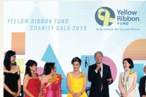
The Yellow Ribbon Fund Charity Gala was graced by Senior Minister and Coordinating Minister for National Security, Mr Teo Chee Hean

The Yellow Ribbon Fund Charity Gala achieved a record-breaking fundraising of amount $1.8 million. The event, attended by 700 guests, was graced by Senior Minister and Coordinating Minister for National Security, Mr Teo Chee Hean. In addition, then Senior Minister of State, Ministry of Communications and Information and Ministry of Culture, Community and Youth, Ms Sim Ann, unveiled the Yellow Ribbon Community Art & Poetry Exhibition during the gala. Themed “Moving Forward Together”, the exhibition showcased 100 artworks and 23 poems created by inmates.