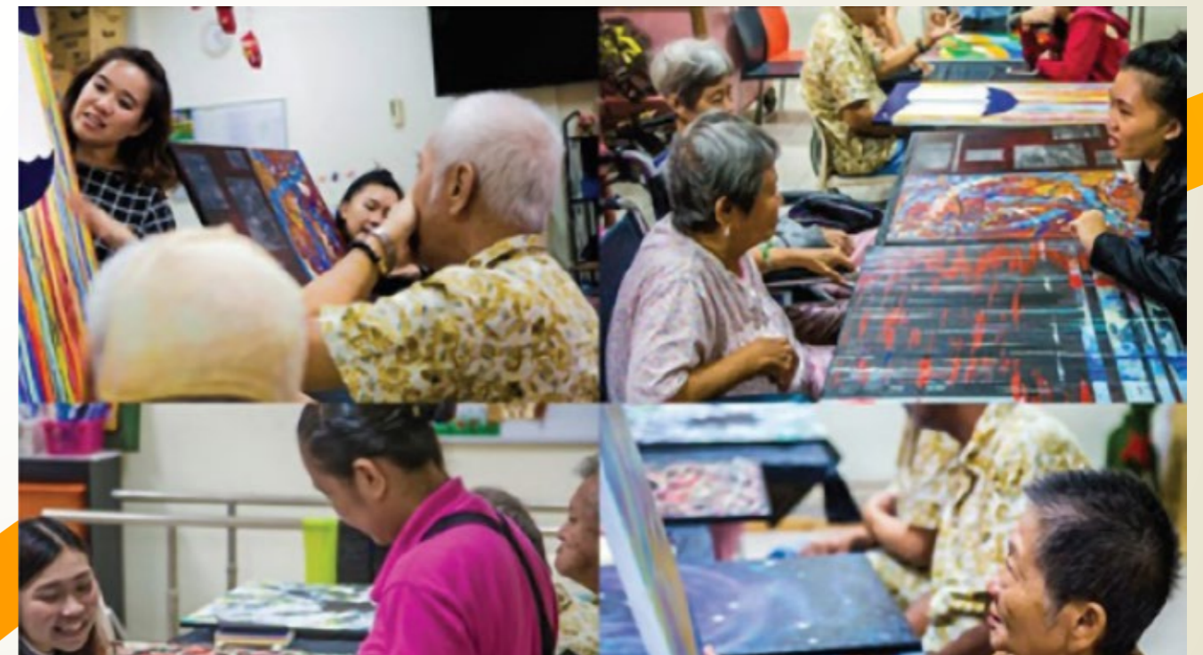
/ Pairing inmate artists from the Visual Arts Hub in prison with elderly residents from the United Medicare Centre (UMC) as "paint-pals"

Yellow Ribbon Project collaborated with the Global Cultural Alliance (GCA) to launch an interactive art initiative. This unique endeavour involved collaborative efforts, pairing inmate artists from the Visual Arts Hub in prison with elderly residents from the United Medicare Centre (UMC) as "paint-pals" to exchange their artistic creations. GCA facilitated the project by enlisting a digital technology partner to educate inmates on incorporating augmented reality elements into their artworks. The resulting pieces were showcased at GCA's gallery and later exhibited at YRP's roadshow at The Star Vista. This collaboration aimed to provide avenues for both communities, despite their diverse backgrounds, to make meaningful contributions to society. By fostering a creative exchange of ideas through this interactive art platform, it brought together these distinct communities for a powerful and shared experience.