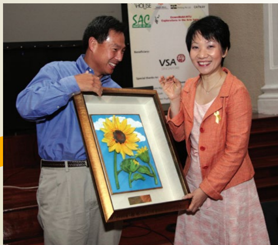
/ The Yellow Ribbon Community Art Exhibition was attended by then Minister of State, Ministry of National Development, Ms Grace Fu

The Yellow Ribbon Project received the Honourable Mention for Outstanding Achievement in Public Relations Campaign from the United Nations Department of Public Information.