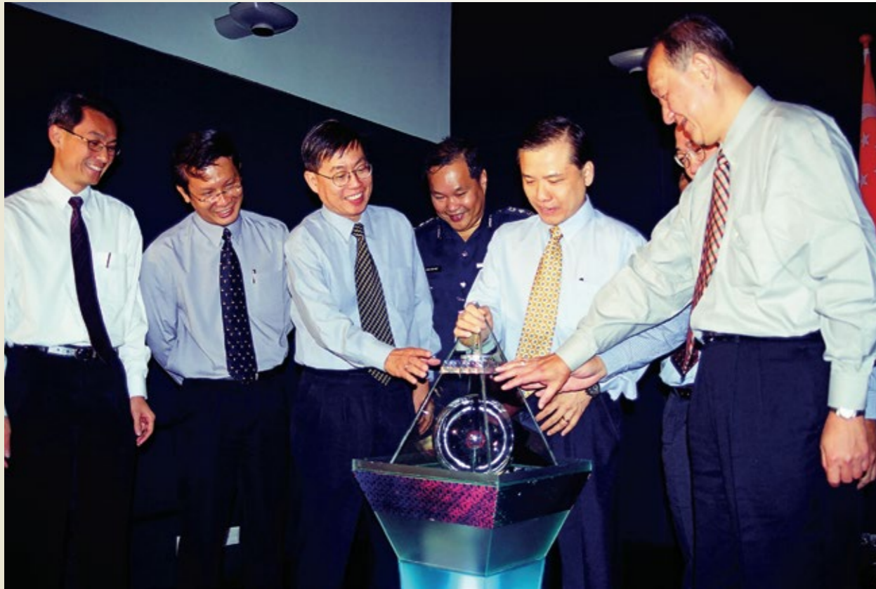
/ CARE Network launch in year 2000

The CARE Network was formed to bring together agencies in the aftercare landscape, to develop a coordinated approach towards supporting the rehabilitation and reintegration of ex-offenders, and to help them transit back into the community as contributing citizens. The founding members of the CARE Network were MHA, SPS, SCORE, National Council of Social Services (NCSS), Singapore Aftercare Association (SACA), Singapore Anti-Narcotics Association (SANA) and Industrial and Services Co-operative Society Ltd (ISCOS). The Ministry of Community Development, Youth and Sports (MCYS) joined in 2006. SPS took on the role as the CARE Network Secretariat.