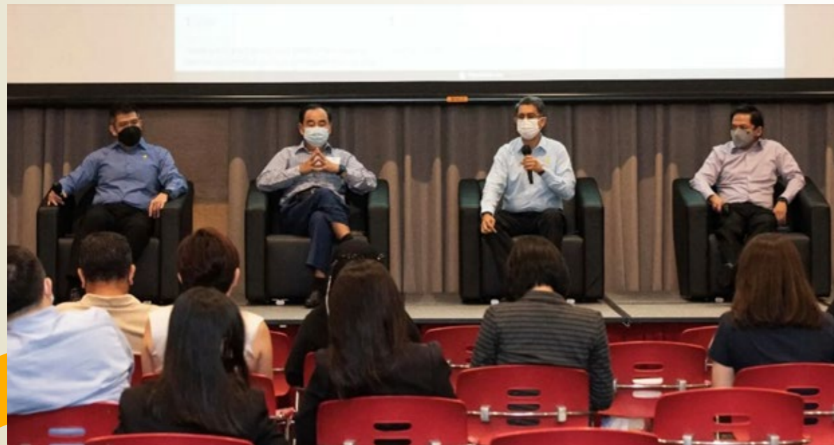
/ Dialogue during YR Connects 2022

Over 30 key industry stakeholders comprising trade associations and employers attended the dialogue, which allowed participants to bridge different perspectives and build consensus on the best practices to support ex-offenders. As part of the dialogue, YRSG also outlined its employment support initiatives over the next few years, such as the TAP (Train and Place) & Grow initiative.