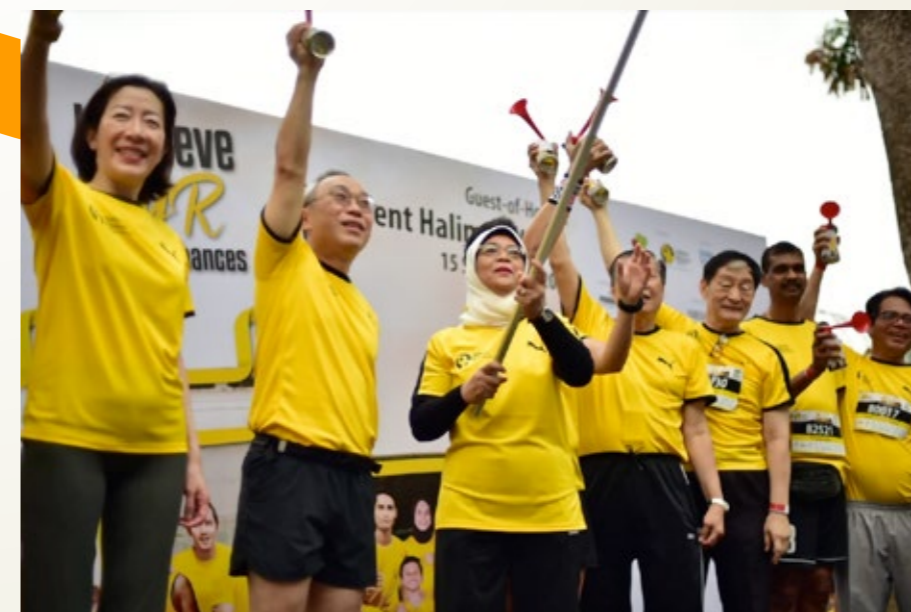
/ The 11 th edition of the Yellow Ribbon Prison Run received the esteemed presence of then President of Singapore, Mdm Halimah Yacob

The 11 th edition of the Yellow Ribbon Prison Run received the esteemed presence of Singapore's then President, Mdm Halimah Yacob. A remarkable 10,000 participants ran the distance, symbolising their endorsement of second chances. As part of the Reach Out project, a collaborative effort involving the National Day Parade 2019 Celebration Outreach Committee, Yellow Ribbon Project, and Very Special Arts (VSA) Singapore, inmates had the opportunity to give back to society by packing 50,000 goodie packs for National Day.