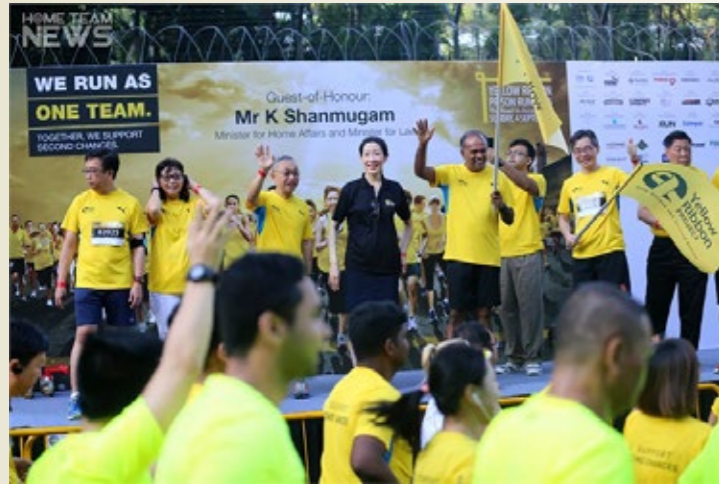
/ The 8 th Yellow Ribbon Prison Run, which was flagged off by Minister for Home Affairs and Minister for Law, Mr K. Shanmugam

More than 9,000 people took part in the 8 th Yellow Ribbon Prison Run, which was flagged off by Minister for Home Affairs and Minister for Law, Mr K Shanmugam.