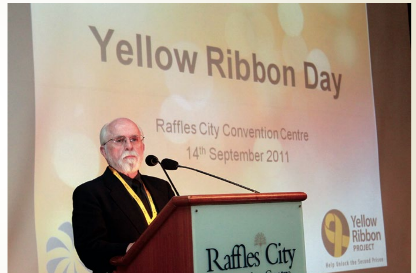
Yellow Ribbon Day where about 130 community partners and representatives from CARE Network gathered to discuss community reintegration issues related to aftercare

At the 13 th International Corrections and Prisons Association (ICPA) Conference held in Singapore, 14 September was designated as the "Yellow Ribbon Day", where about 130 community partners and representatives from CARE Network gathered to discuss community reintegration issues related to aftercare.