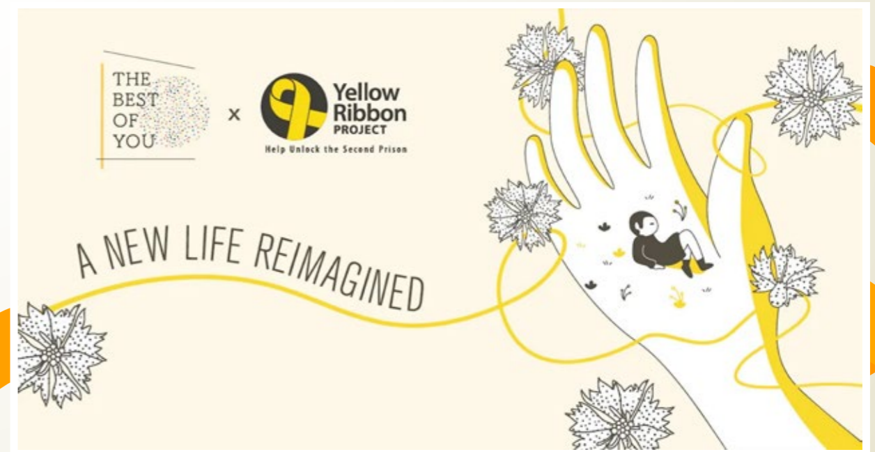
/ Julie’s “Best of You” Yellow Ribbon Project Exhibition