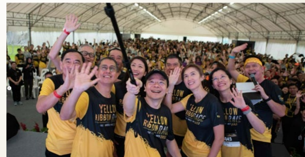
/ Deputy Prime Minister and Minister for Finance, Mr Lawrence Wong, was the Guest-of-Honour for the Yellow Ribbon Race 2022