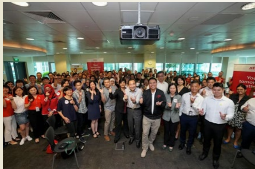
Participants' group photo during YR Connects x EveryWorkerMatters Conversations

Over 80 partner employers, partners from trade associations and social service agencies shared their thoughts, challenges faced and ideas to achieve a more inclusive workforce that supports second chances.