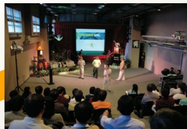
/ Yellow Ribbon Fund’s “Dining Behind Bars”

Yellow Ribbon Fund’s “Dining Behind Bars” raised $54,000 through generous donations from Bukit Panjang Government High School, NTUC Foodfare, ISCOS, NCSS, and Rotary Club of Queenstown.