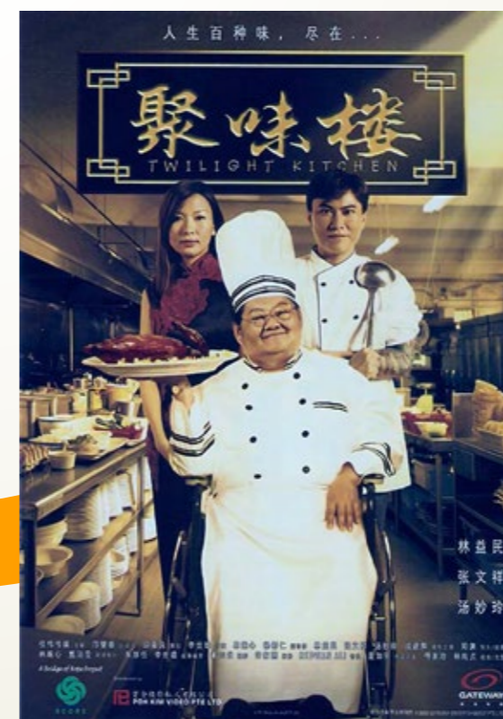
/ Twilight Kitchen (聚味楼 in Mandarin) community film

As part of CARE Network’s efforts to educate the public on the struggles faced by ex-offenders in their reintegration journey, SCORE commissioned a film, titled “ Twilight Kitchen ” (聚味楼 in Mandarin), which was screened in cinemas in 2003. The objective was to encourage companies to employ ex-offenders.