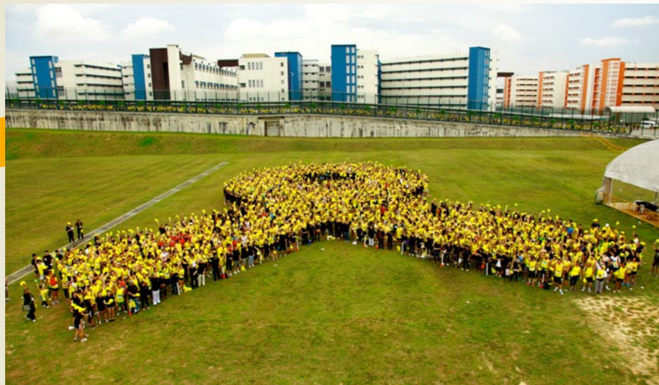
/ The Giant Human Yellow Ribbon Formation

In 2013, 1,230 runners came together to form a Giant Human Yellow Ribbon Formation . This effort helped 2013's edition of the Yellow Ribbon Run to raise more than $130,000 for the Yellow Ribbon Fund. The strong show of support from all walks of the community was testament to how the message of the campaign has permeated into the hearts and minds of society.