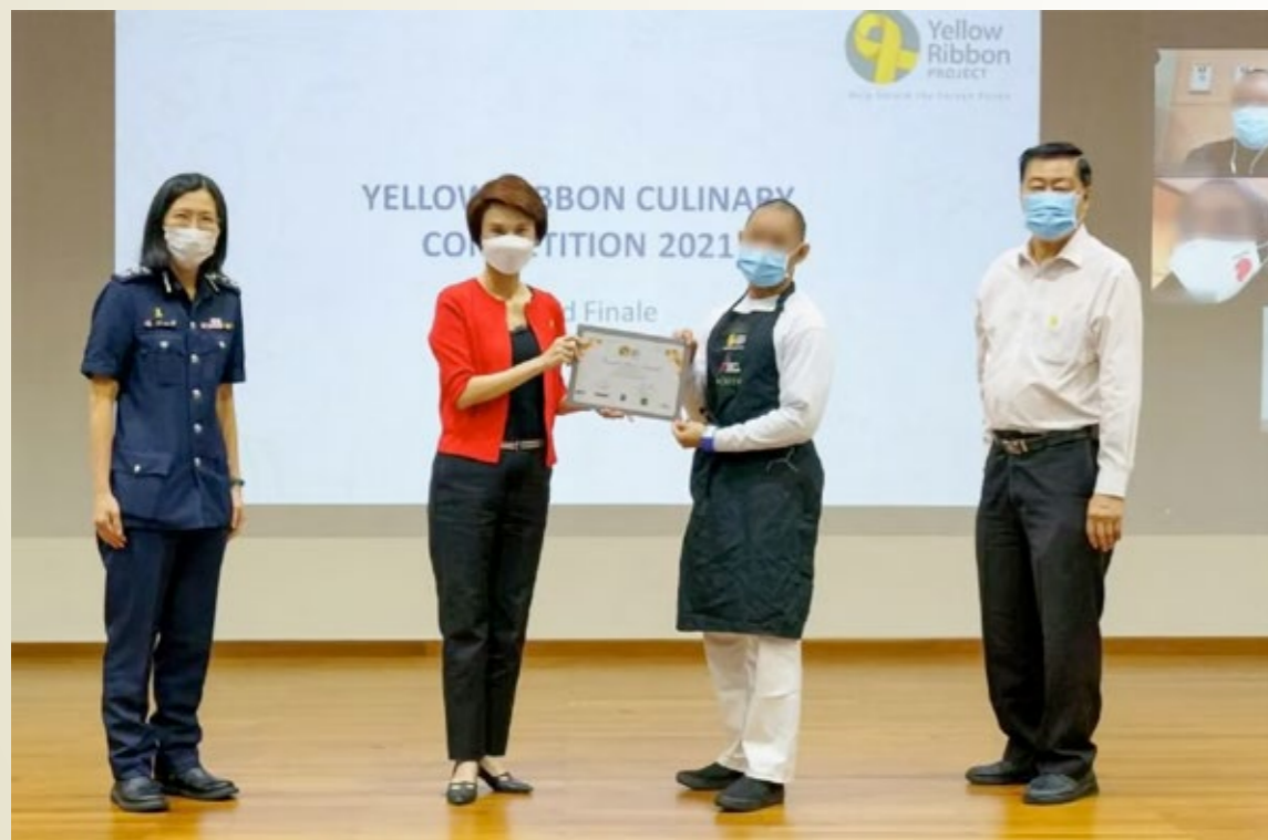
/ The grand finale of the Yellow Ribbon Culinary Competition 2021, graced by Ms Low Yen Ling, Minister of State for Trade and Industry and Minister of State for Culture, Community and Youth

The Yellow Ribbon Culinary Competition was organised to provide inmates with valuable skills training relevant to the F&B industries, ultimately enhancing their employability upon release. Co-organised in collaboration with the Singapore Chefs' Association, the event's theme, "Recipe for Change", drew inspiration from the community's resilience amid the pandemic's disruptions and the inmates' determination to forge their own paths in rehabilitation. Despite the challenges posed by the pandemic, the Yellow Ribbon Culinary Competition garnered vital support from key community partners like Aquaculture Centre of Excellence Pte Ltd, Thai Sing Foodstuffs Industry Pte Ltd, and Sphere Consumer Products Asia Pte. Ltd., who generously sponsored ingredients and food packaging for the event.