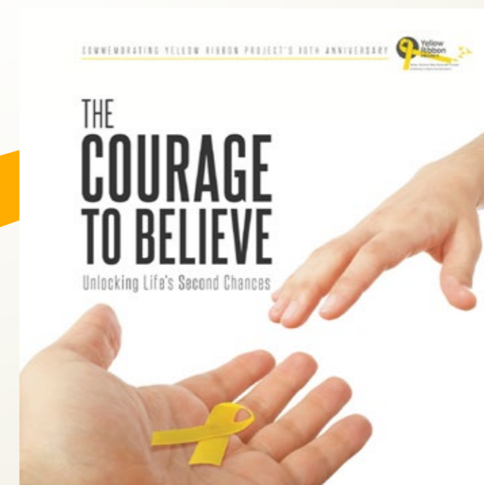
/ The Yellow Ribbon 10 th Anniversary Commemorative Publication, The Courage to Believe

A new logo to celebrate the Yellow Ribbon Project's 10 th Anniversary was commissioned through an online contest. Targeted at the young, the contest engaged the online community through Facebook, Instagram and the corporate website over a two-week period. The winning logo, out of 15 entries, was designed by a polytechnic student. It was used across the YRP's 10 th Anniversary Campaign. This activity provided younger supporters with an opportunity to own the campaign and build greater affinity with the cause.