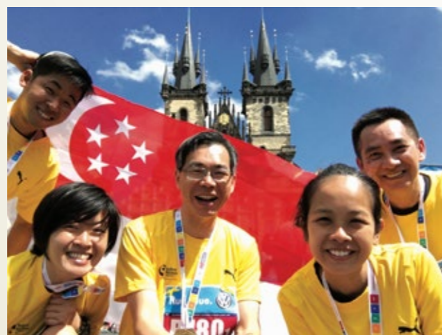
/ Yellow Ribbon Run in Prague

Singapore’s Yellow Ribbon Prison Run inspired the Czech Republic’s Prison Service to organise its own Yellow Ribbon Run as part of the Prague International Marathon.