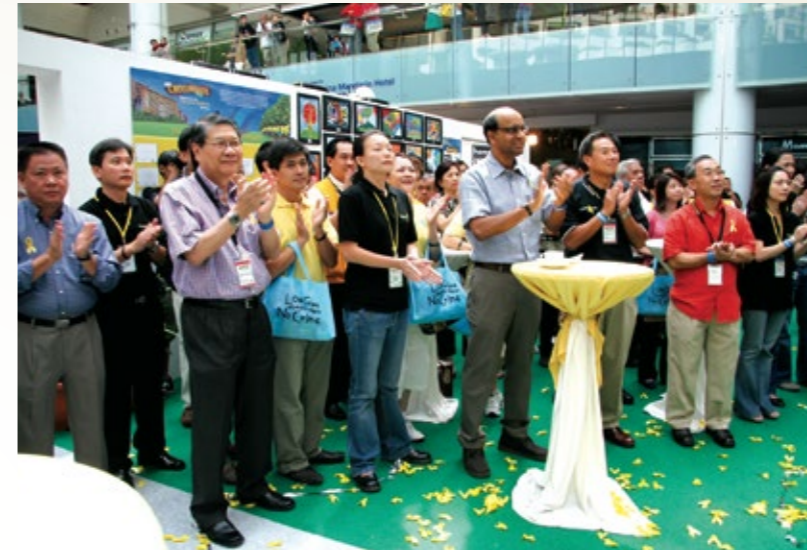
A Yellow Ribbon Journey Exhibition titled “Our Crossroads” was held at Marina Square, graced by then Minister for Finance, Mr Tharman Shanmugaratnam

A Yellow Ribbon Journey Exhibition titled “ Our Crossroads ” was held at Marina Square. More than 5,000 visitors learnt about the issues and challenges affecting inmates, ex-offenders and their families.