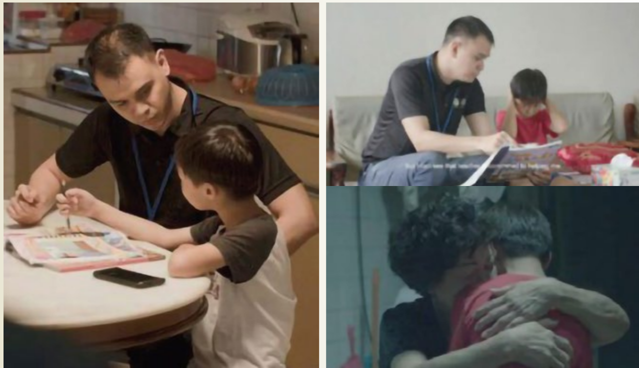
/ Impactful videos centering on the influence of initiatives within the CARE Network

Yellow Ribbon Project forged a partnership with LASALLE College of the Arts to enhance digital outreach and bolster its online visibility. Together, they crafted impactful videos publicising initiatives within the CARE Network. These videos served to broaden their online audience by shedding light on the obstacles confronting ex-offenders and their families. The aim was to inspire viewers to contribute meaningfully to the lives of these beneficiaries and collectively foster an inclusive society. These beneficiary-focused videos were shared across various social media platforms, accumulating close to 3,000 views.