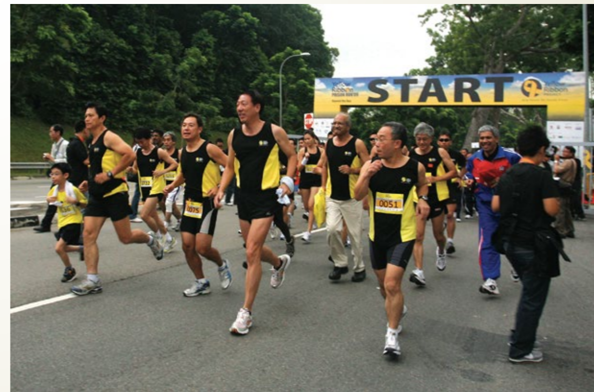
/ The first Yellow Ribbon Prison Run was flagged off by then Deputy Prime Minister, Mr Teo Chee Hean

The first Yellow Ribbon Prison Run (YRPR) was flagged off by then Deputy Prime Minister, Mr Teo Chee Hean, where 6,000 runners demonstrated their support for second chances by running from Changi Village into Changi Prison Complex. Through their participation, $95,000 was raised for the Yellow Ribbon Fund.