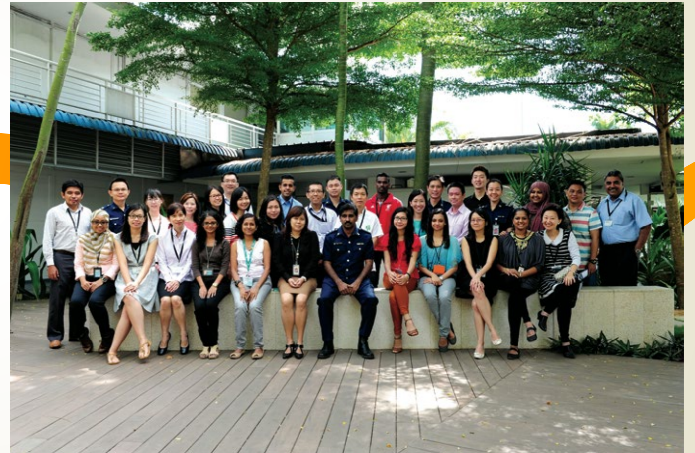
The Inaugural CARE Network Workplan Seminar

The Inaugural CARE Network Workplan Seminar brought together 220 participants from 56 VWOs, religious organisations, community groups and government agencies to discuss the strategies for strengthening throughcare. It also provided opportunities for knowledge-sharing and networking between the CARE Network partners.