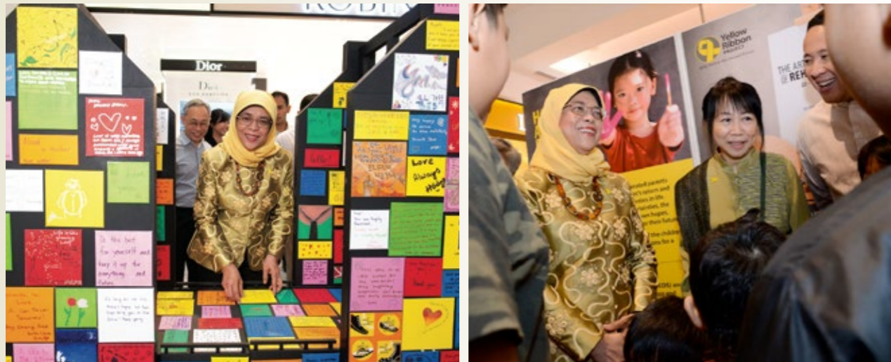
/ The Yellow Ribbon Community Art Exhibition received an honoured visit from then President of Singapore, Mdm Halimah Yacob

Celebrating nine years of partnership between the Yellow Ribbon Project and the Singapore Art Museum, the Yellow Ribbon Community Art Exhibition held at Raffles City Singapore received an honoured visit by then President of Singapore, Mdm Halimah Yacob. Under the theme “Transitions: Crossroads & Choices”, the exhibition showcased 78 artworks, representing the culmination of a year-long collaboration between inmates and their artist mentors.