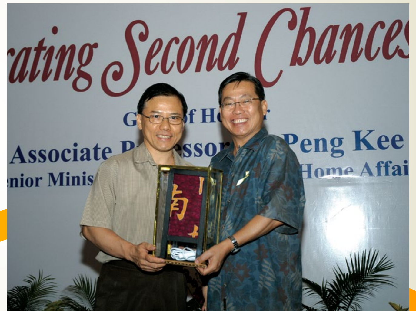
Associate Professor Ho Peng Kee, then Senior Minister for State, Ministry of Law and Ministry of Home Affairs gracing the inaugural Celebrating Second Chances Awards Ceremony

The inaugural Celebrating Second Chances Awards Ceremony aimed to motivate ex-offenders who have stayed crime and drug-free. They received commendations recognising their achievements at the event.