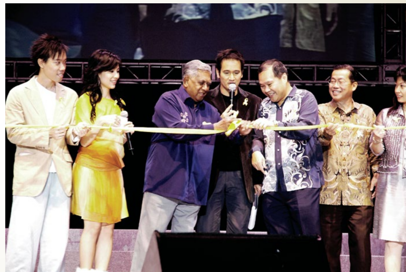
/ Then President of Singapore, Mr S.R. Nathan launched the Yellow Ribbon Project (YRP) and Yellow Ribbon Fund (YRF) during the Yellow Ribbon Charity Concert

Then President of Singapore, Mr S. R. Nathan launched the Yellow Ribbon Project and Yellow Ribbon Fund during the Yellow Ribbon Charity Concert. The concert featured artistes, as well as inmates and ex-offenders who shared their rehabilitation and reintegration experiences through drama, song and dance.