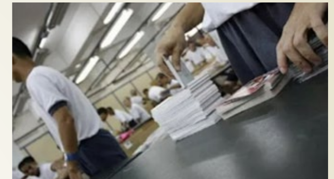
/ Inmates packing 35,000 goodie bags and 100,000 Yellow Ribbon packs

In the same year, inmates contributed back to society by packing 35,000 goodie bags and 100,000 Yellow Ribbon packs for that year's National Day Parade .