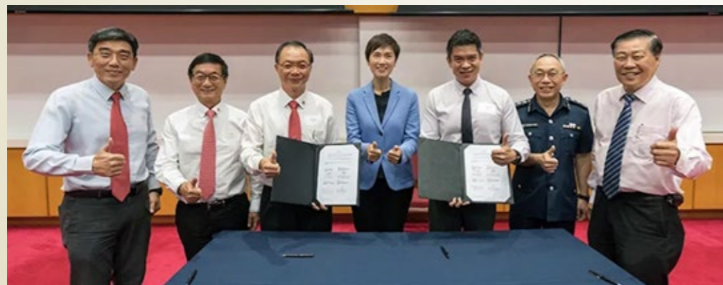
SCORE signed a Memorandum of Understanding with the Singapore Precision Engineering and Technology Association

SCORE signed a Memorandum of Understanding (MOU) with the Singapore Precision Engineering and Technology Association (SPETA). The MOU aimed to boost the employability potential of inmates in the Precision Engineering industry through training and job placement.