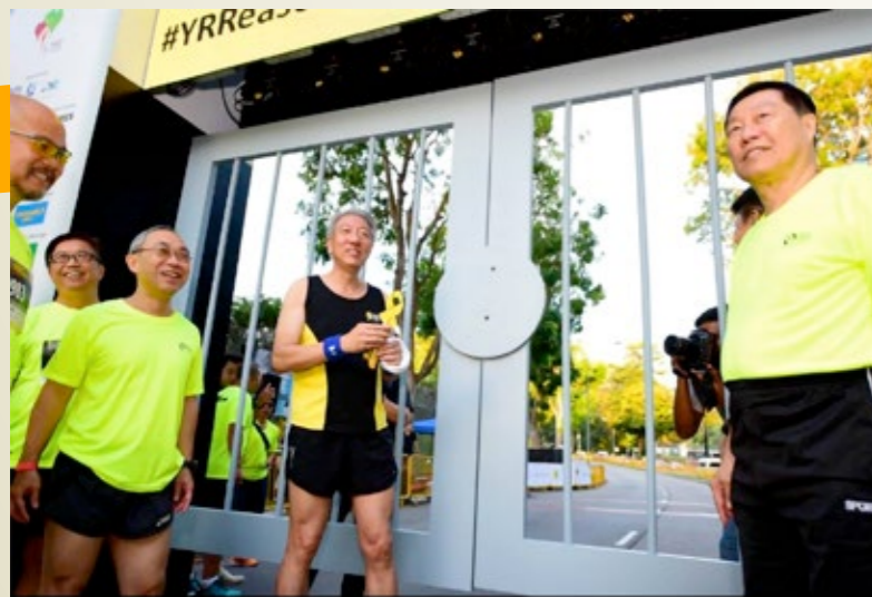
/ The 9 th Yellow Ribbon Prison Run was flagged off by then Deputy Prime Minister and Coordinating Minister for National Security, Mr Teo Chee Hean