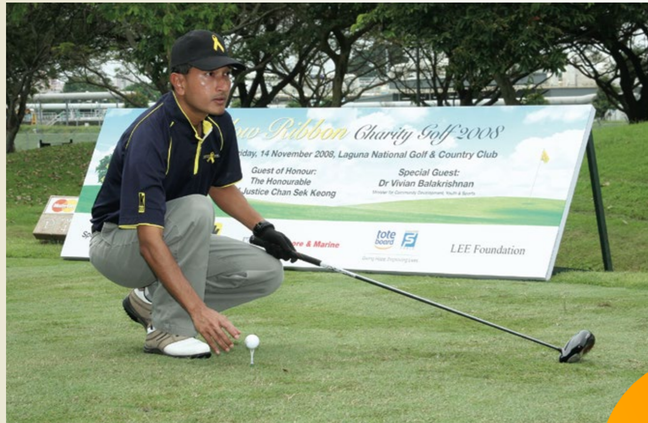
Dr Vivian Balakrishnan, then Minister for Community Development, Youth and Sports, at the Yellow Ribbon Charity Golf Tournament

The first Yellow Ribbon Charity Golf Tournament was held to raise funds for the Yellow Ribbon Fund. It consisted of a golf tournament and an appreciation dinner for participants of the tournament, donors and sponsors.