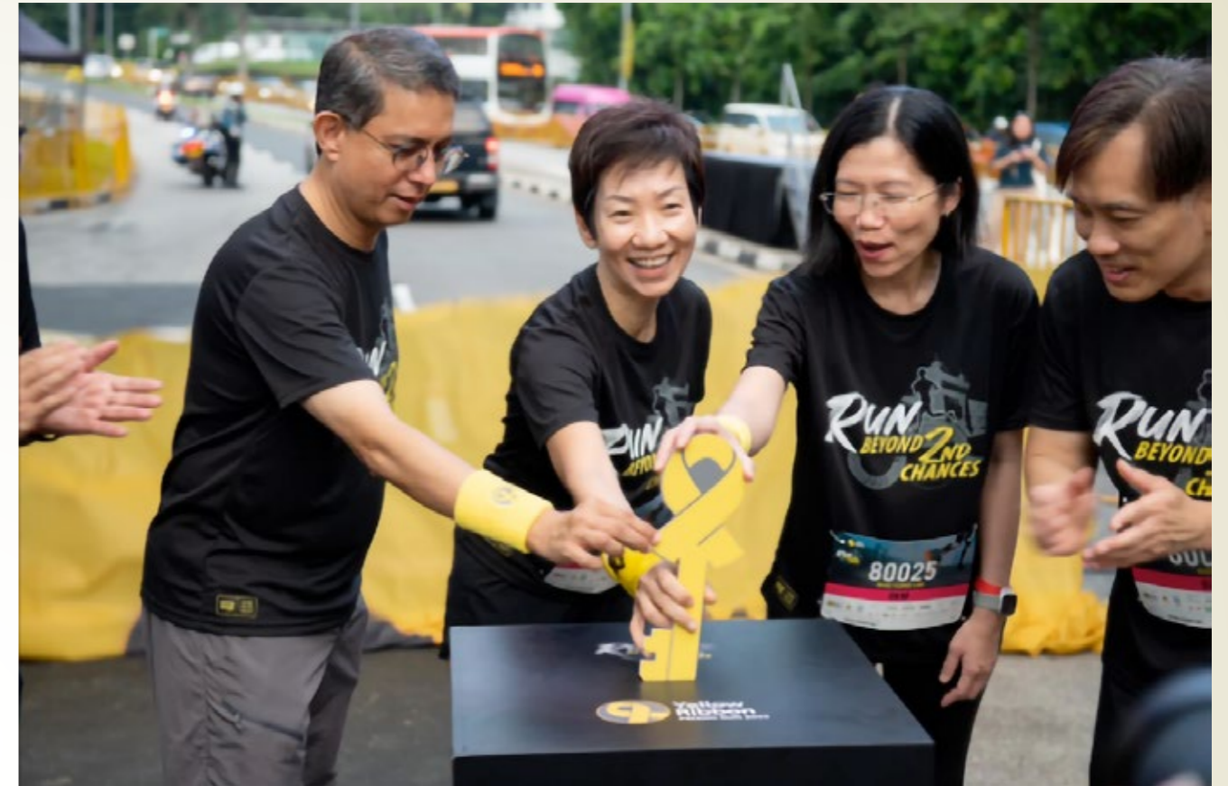
/ Minister for Sustainability and the Environment, Ms Grace Fu, was the Guest-of-Honour for the Yellow Ribbon Prison Run 2023