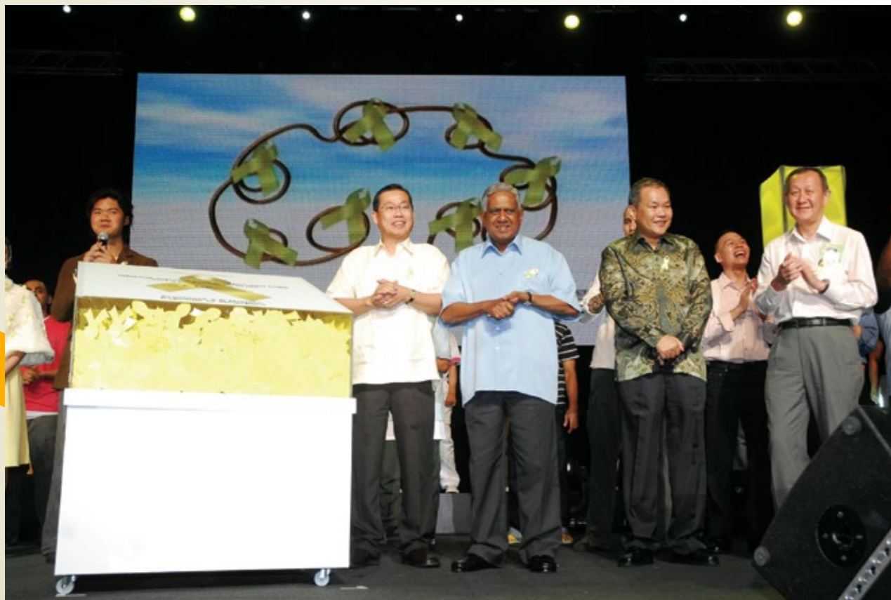
/ The Yellow Ribbon Charity Concert

A YRP theme song, which was a remix of the 1970s song, “Tie a Yellow Ribbon Round the Ole Oak Tree”, that inspired the name “ Yellow Ribbon Project ”, was also produced for the launch.