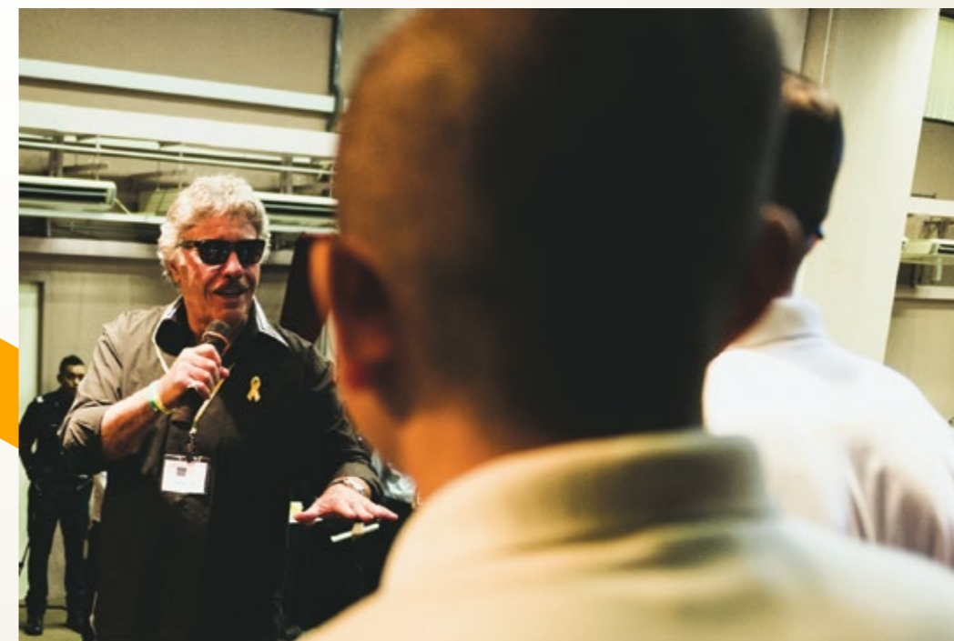
Mr Tony Orlando, singer of the song called “Tie a Yellow Ribbon Round the Ole Oak Tree”, visited inmates from the Performing Arts Centre at Institution A5

The Yellow Ribbon Project was inspired by a hit song from the 1970s, “ Tie a Yellow Ribbon Round the Ole Oak Tree ”. Mr Tony Orlando, singer of the song, visited inmates from the Performing Arts Centre at Institution A5 and shared about the importance of second chances and new beginnings in life.