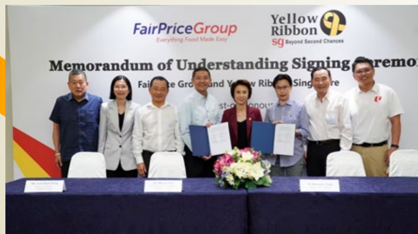
An MOU was signed between YRSG and FairPrice Group

An MOU was signed between YRSG and FairPrice Group, with the aim of providing employment with training opportunities and career development support for ex-offenders in the food services, logistics and retail sectors.