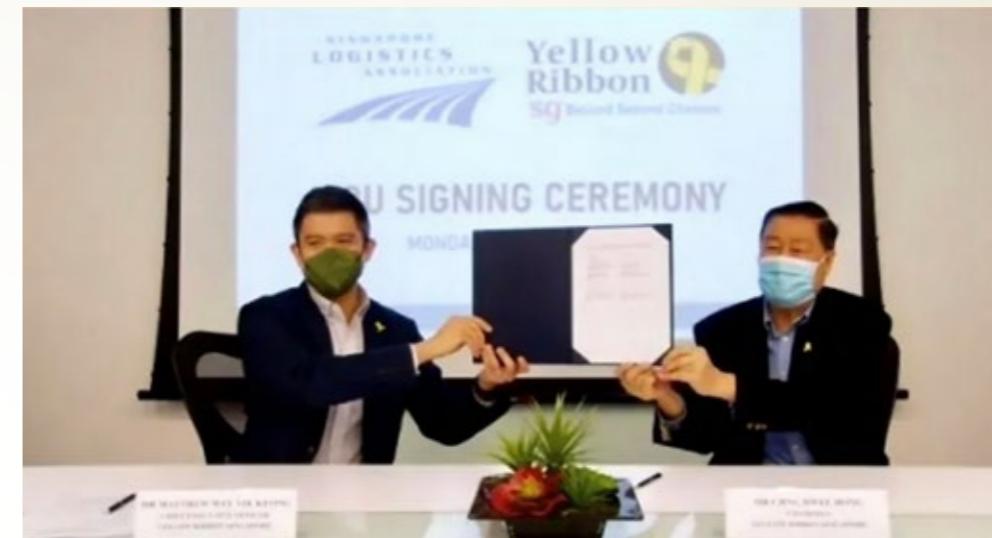
/ YRSG and the Singapore Logistics Association signed an MOU to enhance the career prospects of inmates and ex-offenders in the logistics industry

YRSG and the Singapore Logistics Association signed an MOU that signalled the intent to enhance the career prospects of inmates and ex-offenders in the logistics industry.