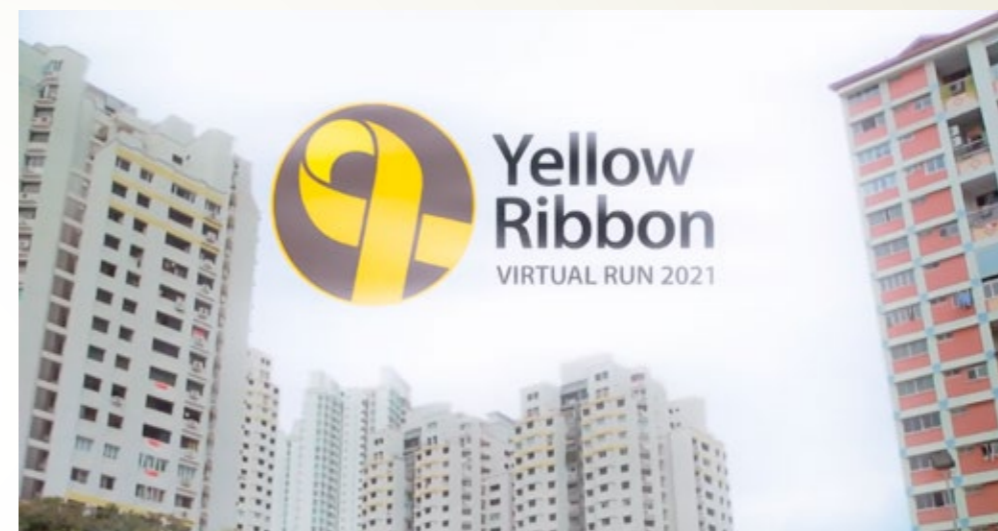
/ Yellow Ribbon Virtual Run 2021

After a one-year hiatus due to COVID-19, the Yellow Ribbon Prison Run made a comeback with a virtual edition . Themed "Challenge YRself" and "Inspire Second Chances", 6,420 individuals enthusiastically signed up to run, walk, or hike yellow-ribbon shaped routes throughout September. For each completed yellow ribbon route, participating organisations pledged to donate $10 to YRF. A total of $103,755 was successfully raised through this event.