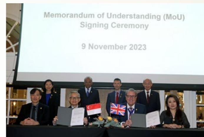
An MOU was signed between the Institute of Chartered Accountants in England and Wales South East Asia Limited and Yellow Ribbon Fund

An MOU was signed between the Institute of Chartered Accountants in England and Wales South East Asia Limited and Yellow Ribbon Fund, with the aim of providing professional certification and career opportunities in the accountancy industry for the family members of inmates and ex-offenders in Singapore.