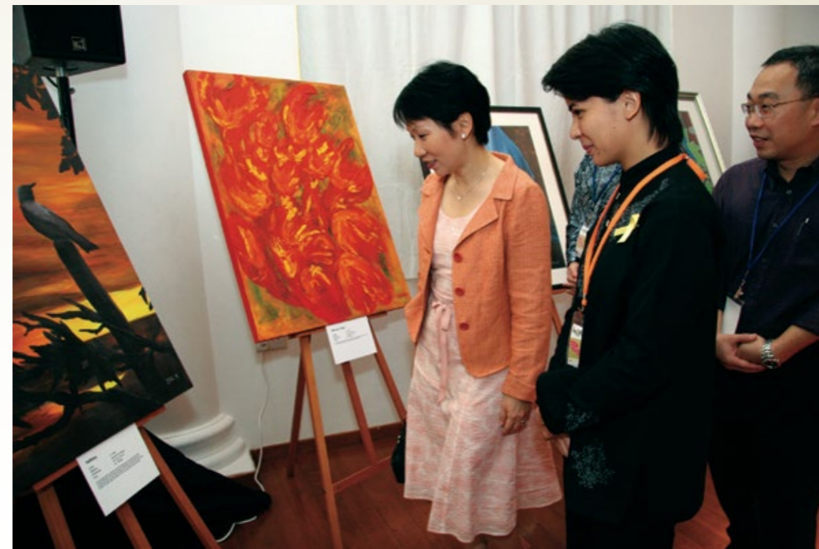
/ Then Minister of State, Ministry of National Development, Ms Grace Fu, viewing the artwork done by the inmates