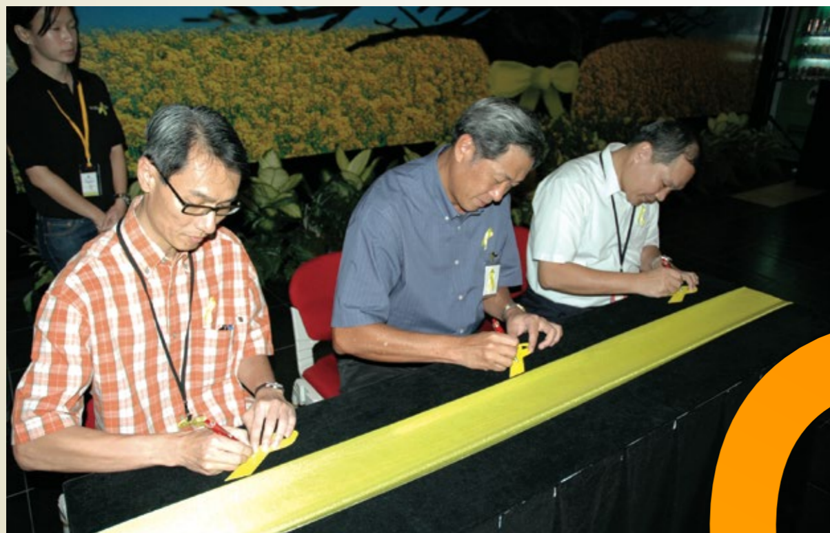
(Pictures from the top to bottom) Dr Vivian Balakrishnan, then Minister for Community Development, Youth and Sports and Second Minister for Trade and Industry at the Yellow Ribbon Conference; Dr Ng Eng Hen, then Minister for Manpower and Second Minister for Education graced the Yellow Ribbon Job Fair