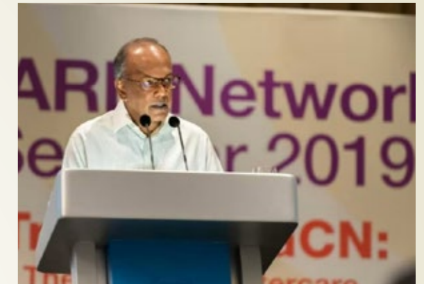
/ Mr K Shanmugam, Minister for Home Affairs and Minister for Law, giving the opening speech at the CARE Network Seminar

The CARE Network organised a seminar with the theme “TransformaCN: The Future of Aftercare”. More than 300 aftercare professionals and 70 partner agencies participated, expressing their dedication to move beyond the two-year recidivism rate and work collectively towards reducing the five-year recidivism rate.