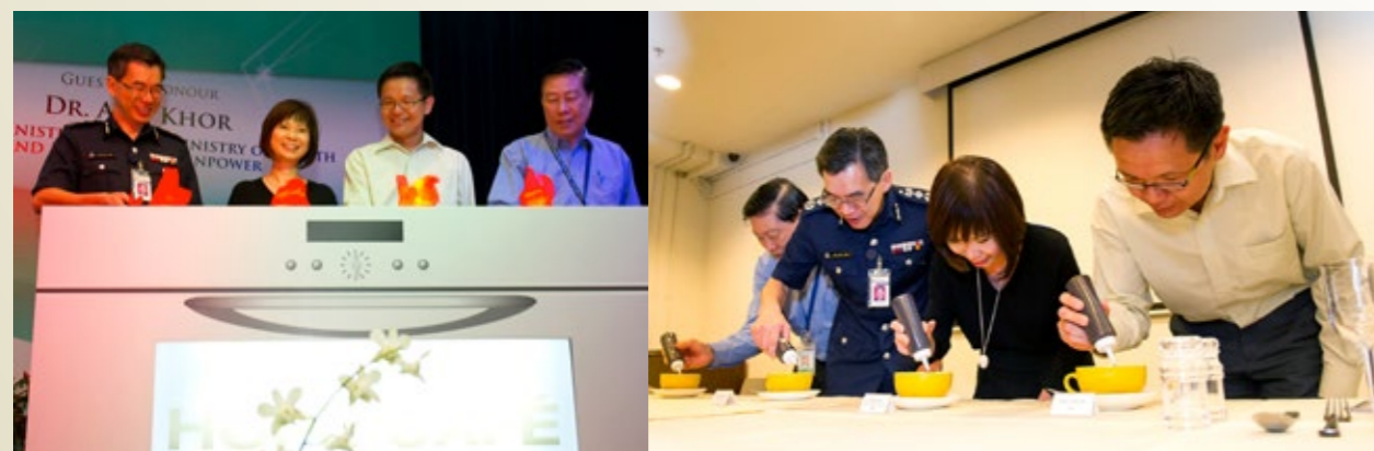
Official opening of Hope Cafe - Training Kitchen and Restaurant