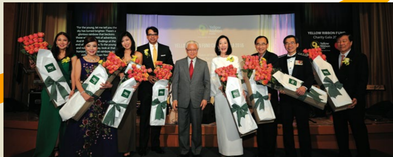
Then President of Singapore, Dr Tony Tan Keng Yam, attended the Yellow Ribbon Fund Charity Gala in 2015