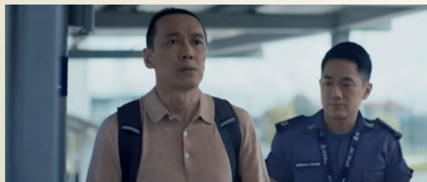
/ Screenshot of the Yellow Ribbon Project brand video, titled “We Are Each Other’s Second Chances”

The Yellow Ribbon Project brand video, titled “We Are Each Other’s Second Chances”, was introduced. As of 2021, over 400 ex-offenders and 800 community partners have actively contributed to various Yellow Ribbon Project events and activities. The CARE Network aspires for increased engagement from individuals and organisations, fostering support for the meaningful cause of reintegrating ex-offenders and building an inclusive society.