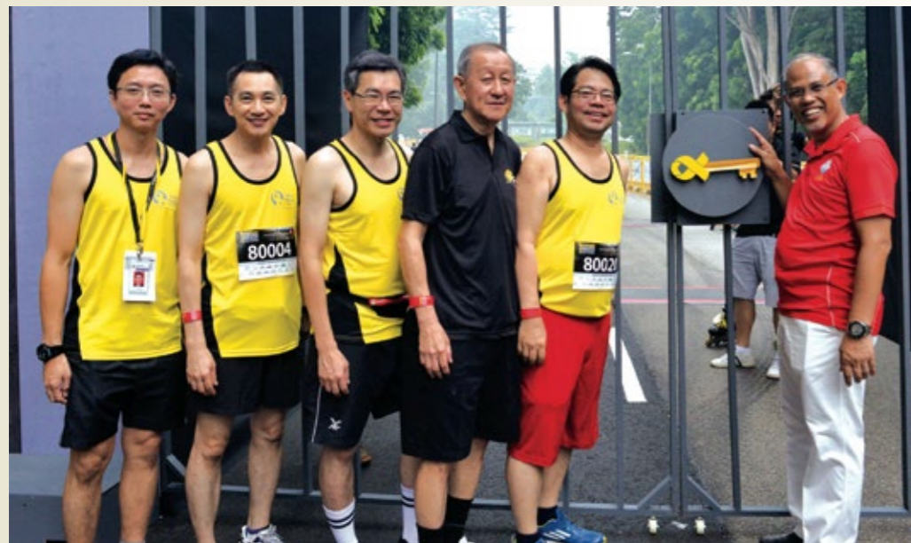
The 7 th Yellow Ribbon Prison Run was flagged off by then Second Minister for Home Affairs and Second Minister for Foreign Affairs, Mr Masagos Zulkifli

The 7 th Yellow Ribbon Prison Run was flagged off by then Second Minister for Home Affairs and Second Minister for Foreign Affairs, Mr Masagos Zulkifli. The run garnered participation from over 7,000 runners and raised $85,000. Then President of Singapore, Dr Tony Tan Keng Yam, attended the Yellow Ribbon Fund Charity Gala as the Guest-of-Honour, raising $920,072.