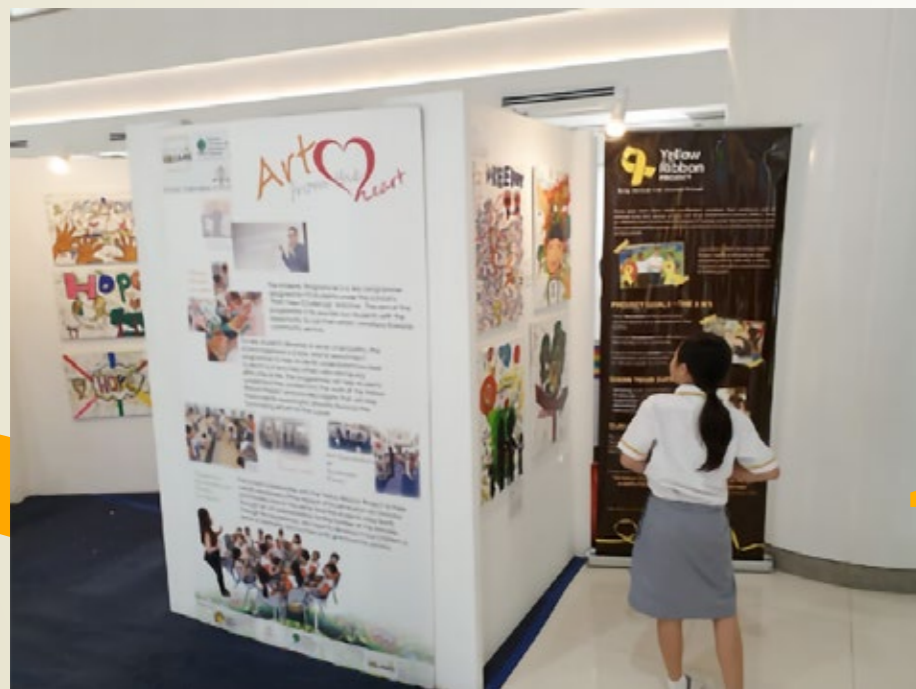
/ Palm View Primary School Art Exhibition

Since 2015, Palm View Primary School has integrated the Yellow Ribbon Project into its Community Involvement Programme. Through their Artizenry Programme, they have forged a partnership with the Yellow Ribbon Project to create paintings aimed at fundraising for the Yellow Ribbon Fund. This initiative, a component of the school curriculum, instils empathy in students by fostering a deeper comprehension of the Yellow Ribbon Project's mission. In a demonstration of solidarity for second chances, 220 Primary 3 students collaborated in teams to produce paintings. These artworks were showcased at the "Art from the Heart" exhibition held at Buangkok Square Mall, showcasing the students' support for the cause of rehabilitation and societal reintegration.