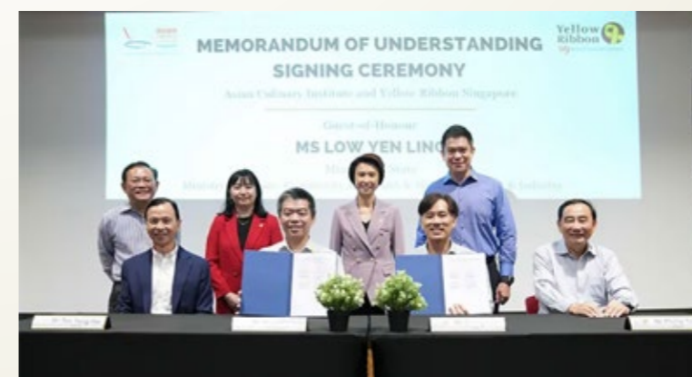
An MOU was signed between YRSG and Nanyang Polytechnic's Asian Culinary Institute (NYP-ACI)

An MOU was signed between YRSG and Nanyang Polytechnic's Asian Culinary Institute (NYP-ACI) to enhance employment opportunities for inmates and ex-offenders in the food services industry.