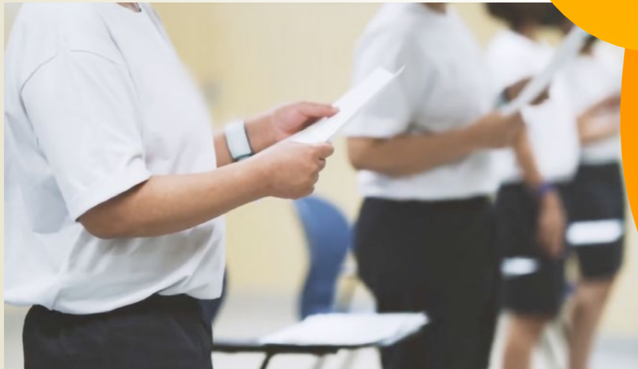
/ Inmate participants preparing for the Yellow Ribbon Songwriting Competition

The Composers & Authors Society of Singapore (COMPASS) and YRP collaborated to organise the Yellow Ribbon Songwriting Competition, to showcase the songwriting abilities of inmates. The theme, "Hope", prompted participants to compose and perform songs centred on the concept of hope while within the confines of prison. Typically conducted behind closed doors, 2021's edition broke with tradition. For the first time, the pre-recorded contest was accessible to the public, offering a glimpse into the talents and creative expressions of inmates.