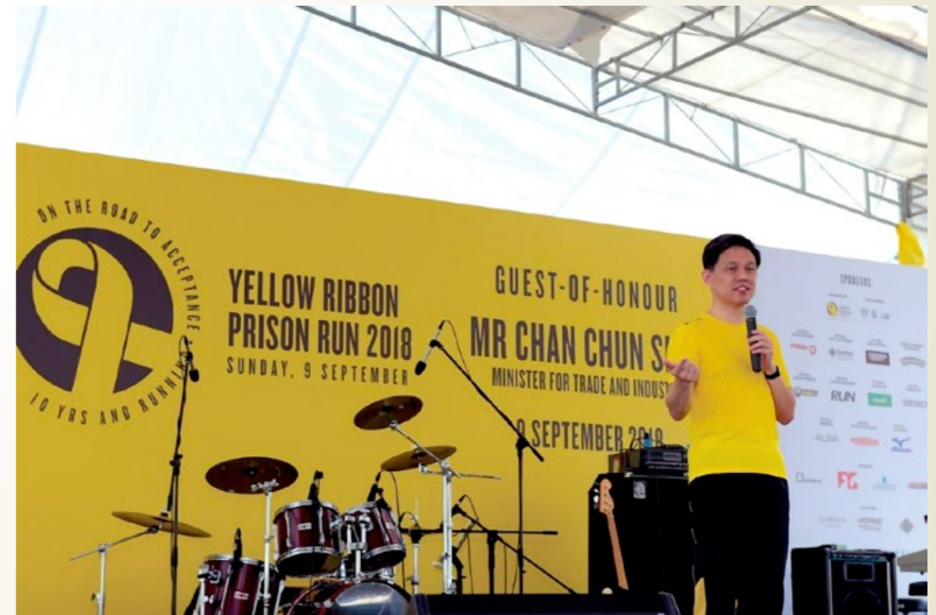
/ Mr Chan Chun Sing, then Minister for Trade and Industry was the Guest-of-Honour for the 10 th Yellow Ribbon Prison Run

Since its inception in 2009, the Yellow Ribbon Prison Run has raised over $1 million for the Yellow Ribbon Fund, contributing to programmes and services aimed at supporting ex-offenders and their families. The Yellow Ribbon Prison Run in 2018 had Mr Chan Chun Sing, then Minister for Trade and Industry, as the Guest-of-Honour for the event.