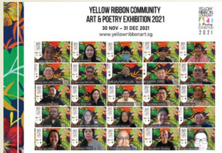
/ Yellow Ribbon Community Art & Poetry Exhibition in 2021

total fundraising amount of $4,446 for YRF. 2021 also marked the inaugural collaboration between YRP and CANVAS, a support group established in 2019 specifically for ex-offenders who had undergone training in visual arts programmes during their time behind bars. This partnership offered new avenues for artistic expression and support for those seeking to rebuild their lives after incarceration.