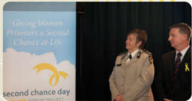
2011 Second Chance Day in Australia

The Second Chance Day in Perth, organized by Yellow Ribbon Project Australia, drew inspiration from similar initiatives in Singapore and Fiji. It created a greater understanding and empathy towards former female and youth prisoners, helping to break down the stigmas associated with incarceration. It also demonstrated how a supportive community can help former prisoners find new opportunities in the workplace, education, housing, and more. Personal stories of transformation and perseverance, fueled by a desire to give back, highlighted the importance of second chances and lived experiences.