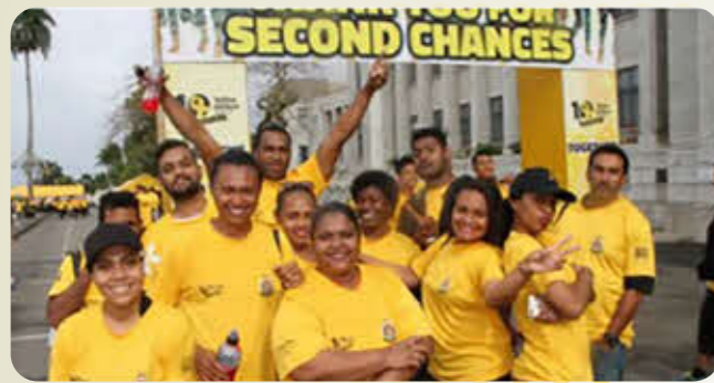
2008 Launch of Yellow Ribbon project in Fiji

Over the years, the Yellow Ribbon Project has not only garnered much support from many well-meaning individuals and corporate partners, but also gained traction beyond the shores of Singapore. It has gained international attention and been replicated in various forms across the globe. Singapore aspires and is committed to do more in creating a global Yellow Ribbon network.